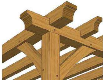
Atherstone 1 Bay

W 3.30 metres D 3.30 metres H 2.45 metres