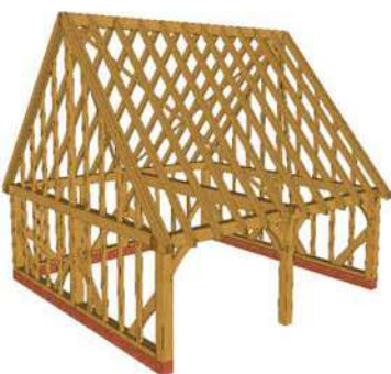
Fordcroft 2 Bay

W 3.32 metres D 6.00 metres H 3.75 metres