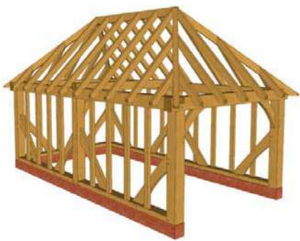
Burford 1 Bay (Full Hip)

W 3.32 metres D 6.00 metres H 3.77 metres