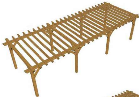
Atherstone 3 Bay

W 3.30 metres D 6.46 metres H 2.45 metres