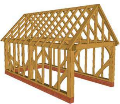
Fordcroft 1 Bay (Gable End)

W 3.32 metres D 6.00 metres H 3.75 metres