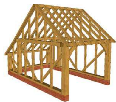
Chantemarle 1 Bay (Gable End w/ Catslide)

W 3.115 metres D 5.00 metres H 3.66 metres