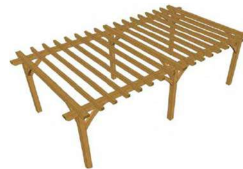
Durville 2 Bay

W 3.30 metres D 3.3m metres H 2.45 metres