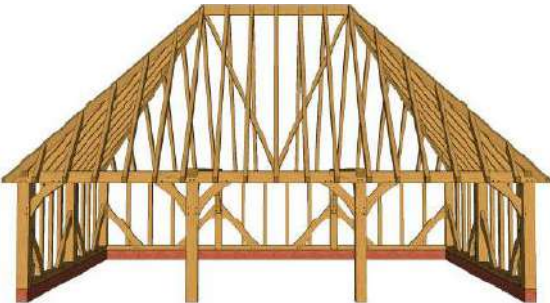
Burford 3 Bay

W 6.23 metres D 6.00 metres H 5.73 metres