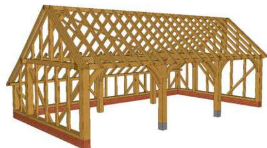
Chantemarle 3 Bay

W 6.00 metres D 5.00 metres H 3.66 metres