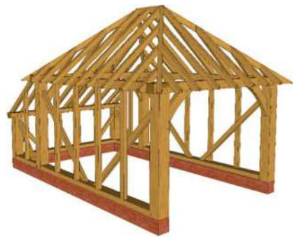
Broadwindsor 1 Bay (Full Hip w/ Catslide)

W 3.115 metres D 5.00 metres H 3.37 metres