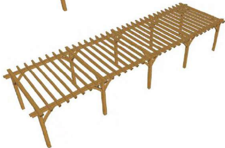
Atherstone 4 Bay

W 3.30 metres D 9.61 metres H 2.45 metres