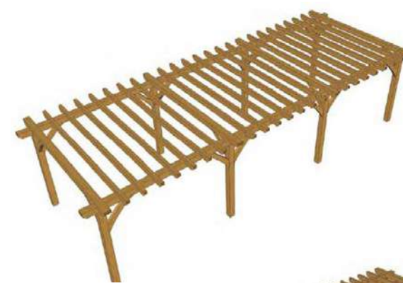
Durville 3 Bay

W 3.30 metres D 6.46 metres H 2.45 metres