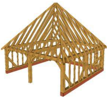
Burford 2 Bay

W 3.32 metres D 6.00 metres H 3.77 metres