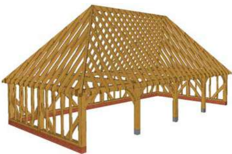
Burford 4 Bay

W 9.23 metres D 6.00 metres H 5.73 metres