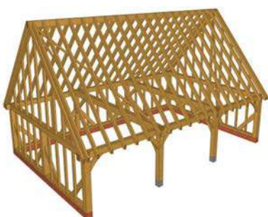
Fordcroft 3 Bay

W 6.23 metres D 6.00 metres H 5.765 metres