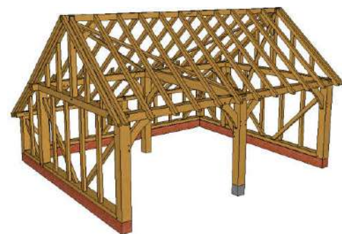
Chantemarle 2 Bay

W 3.115 metres D 5.00 metres H 3.66 metres