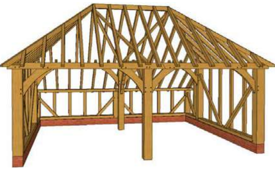
Broadwindsor 2 Bay

W 3.115 metres D 5.00 metres H 3.37 metres