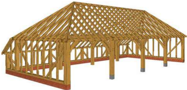
Broadwindsor 3 Bay

W 6.00 metres D 5.00 metres H 3.66 metres