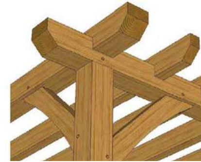
Durville 1 Bay

W 3.30 metres D 3.3m metres H 2.45 metres