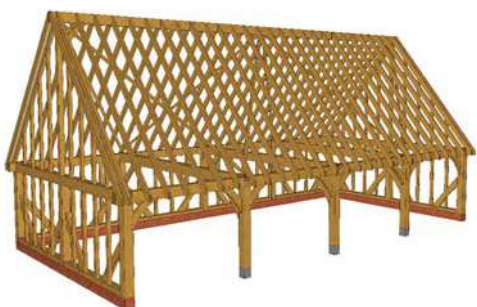
Fordcroft 4 Bay

W 9.23 metres D 6.00 metres H 5.765 metres